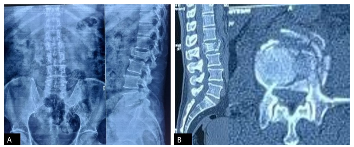
Figure 2. L2 Burst fracture, AO type A4. (A) X-ray shows L2 body fracture involving both superior and inferior endplate with decreased height and retropulsion of fragment into the canal, (B) CT scan of the same patient, better delineate the fracture morphology.